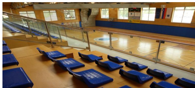
Sporting home Sevnica